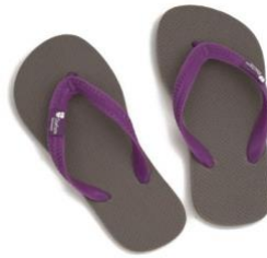
Open toe or open back shoes