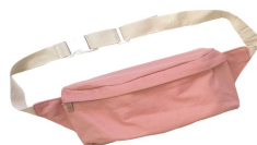
Fanny Pack or Belt Bag