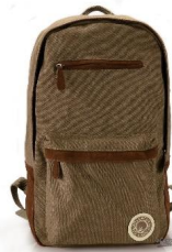
Bookbags, or Bookbag style purse